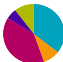
Region (Absolute weight)