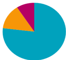
Segment (Absolute weight)